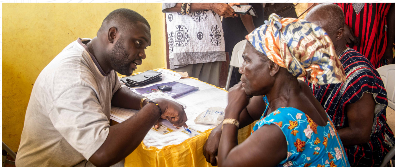
A female farmer going through the registration process of the cocoa farmers pension scheme

Over 30 media houses participated in the press conference