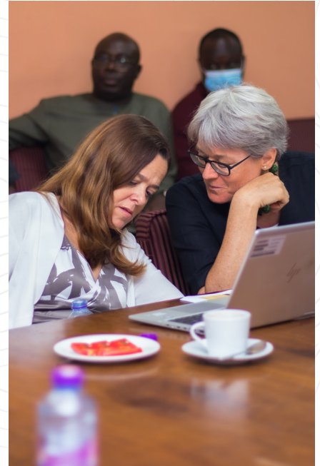
Shots from COCOBOD and SWISSCO meeting held in Accra

Ghana Cocoa Board (COCOBOD) and the Swiss Platform for Sustainable Cocoa (SWISSCO) have taken steps to strengthen existing bilateral relations in the cocoa sector through a joint programme aimed at promoting sustainability within the value chain.