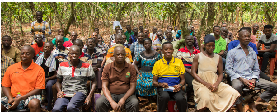
Farmers present during the sensitization programme

Meanwhile, plans are far advanced to gradually enroll all farmers in the country before the next cocoa season begins, barring any challenges.