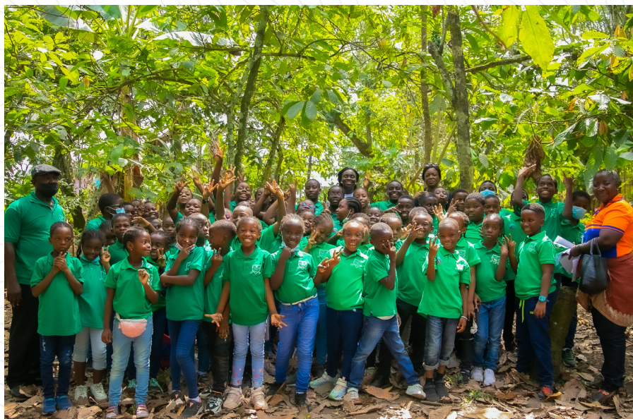
Pupils of ALSYD Academy in a group photograph at the Tetteh Quashie farm

Ghana Cocoa Board (COCOBOD) says the country's per capita consumption of processed cocoa products can significantly improve if a collective effort is made to build a consumption habit amongst children.