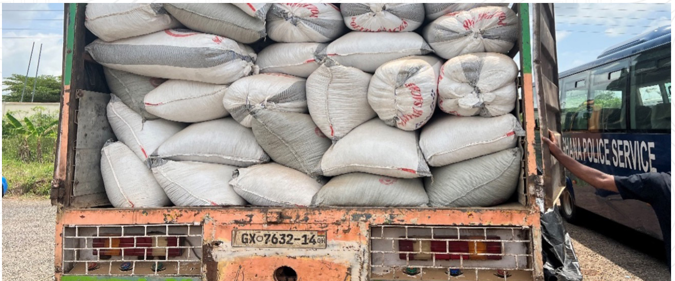
A truck load of smuggled cocoa intercepted by the Ghana Police Service

Meanwhile, the smuggling suspects have been arraigned before various courts.