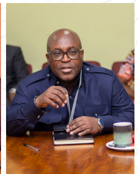
Shots from COCOBOD's management meeting with EU delegation

System (CMS) to ensure cocoa traceability and sustainability.