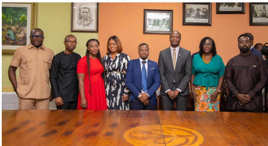
A group photograph of members of the NCPCC